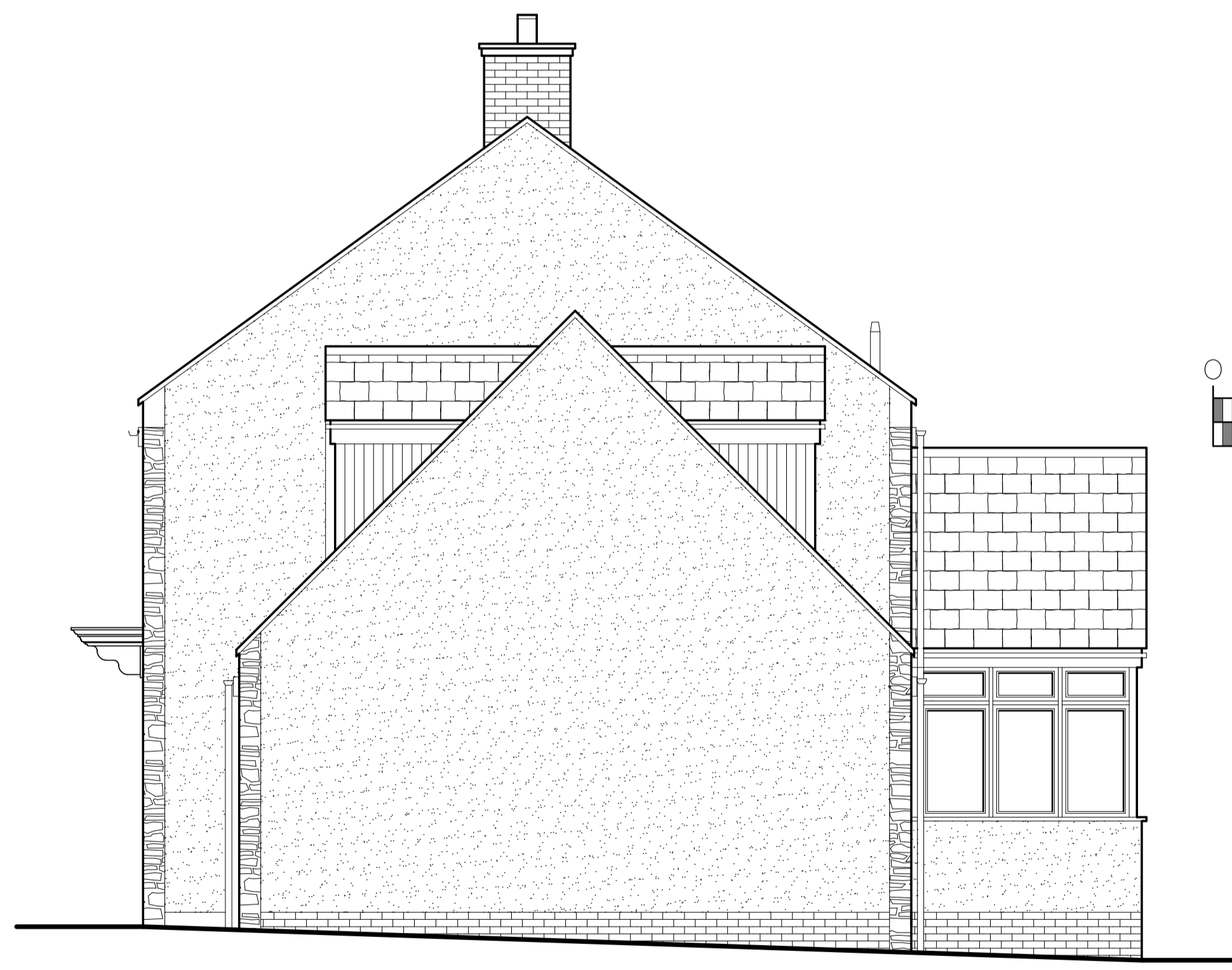
Proposed side elevation (West) Plot 3