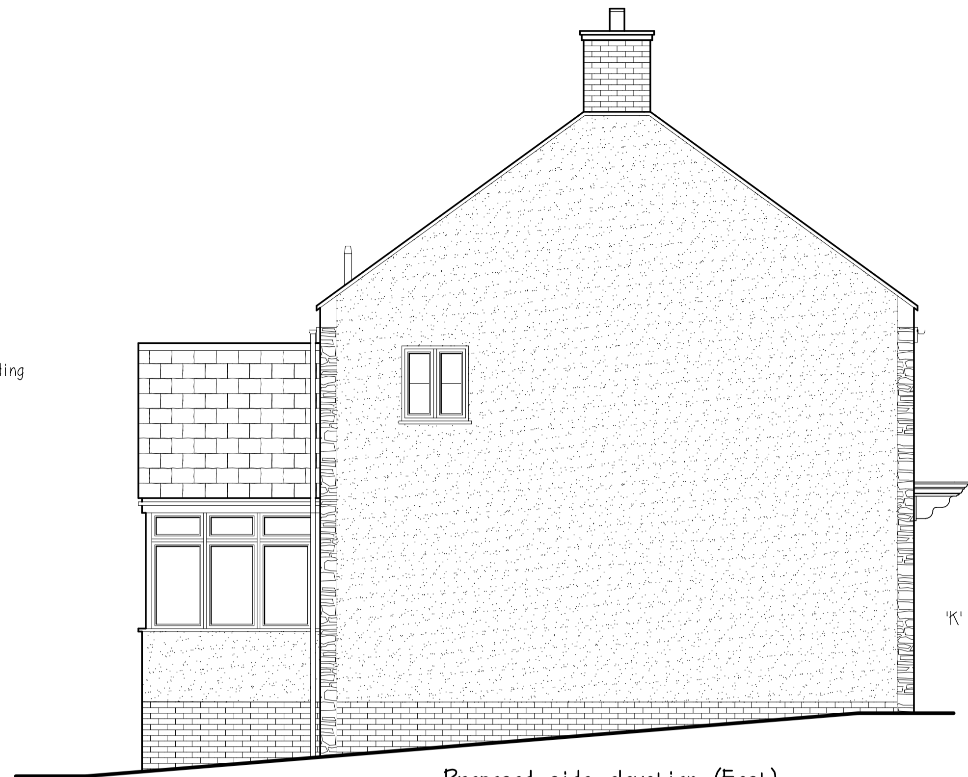
Proposed side elevation (East) Plot 3