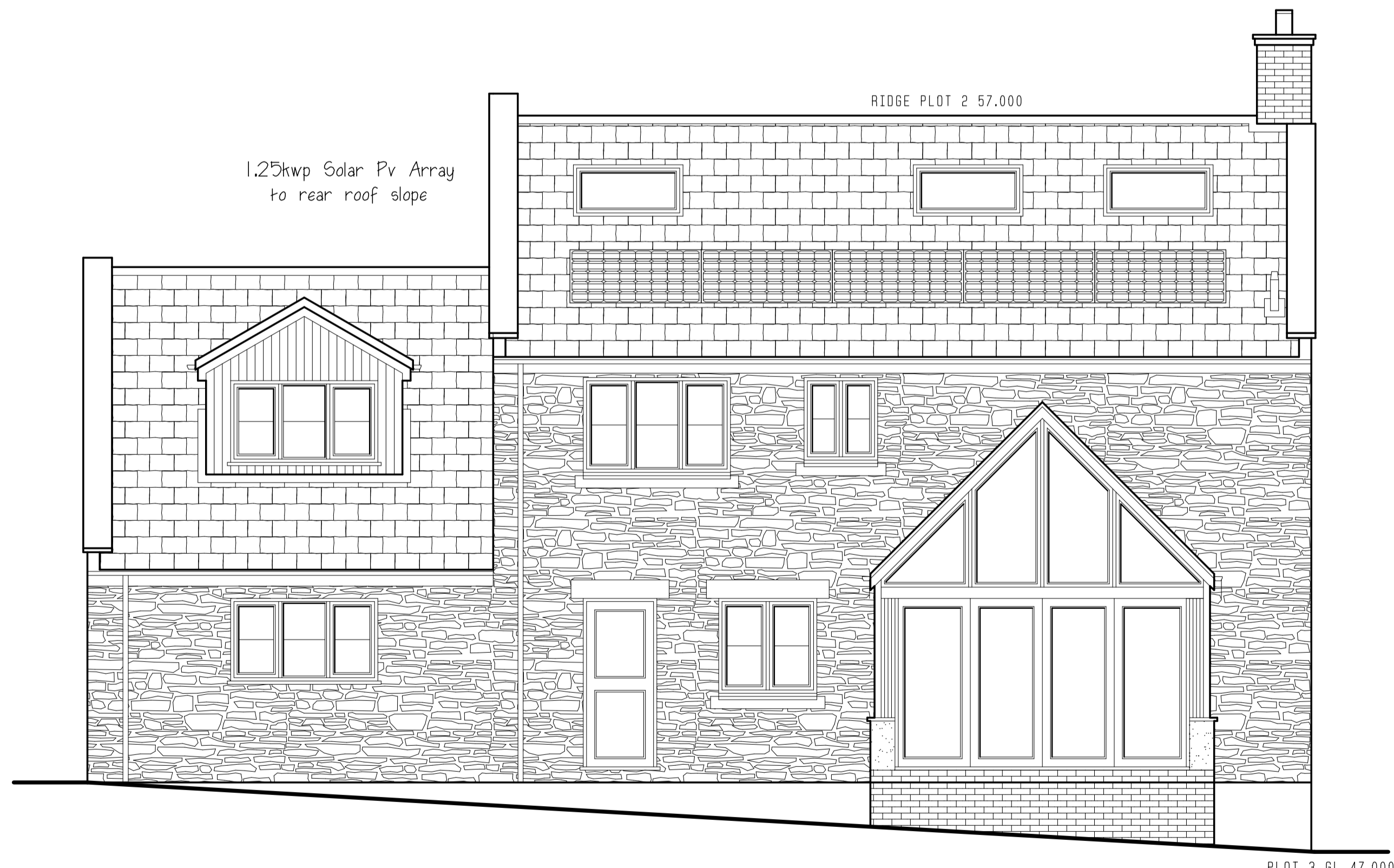
Proposed Rear Elevation (South) PLOT 3